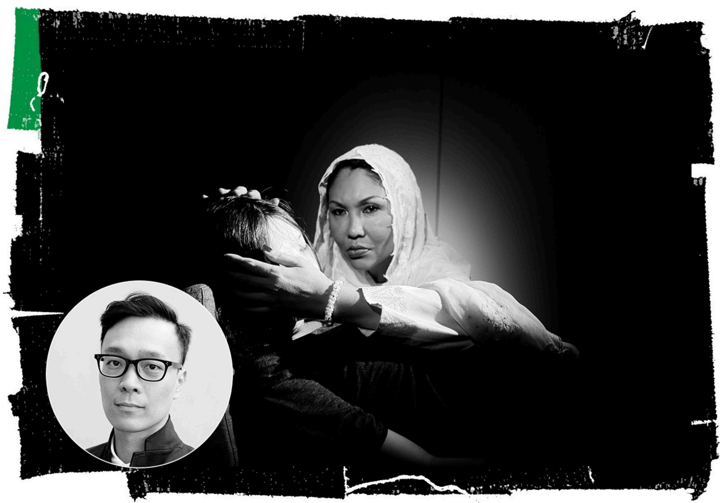
Film still credit: Kopi Julia by Tan Bee Thiam