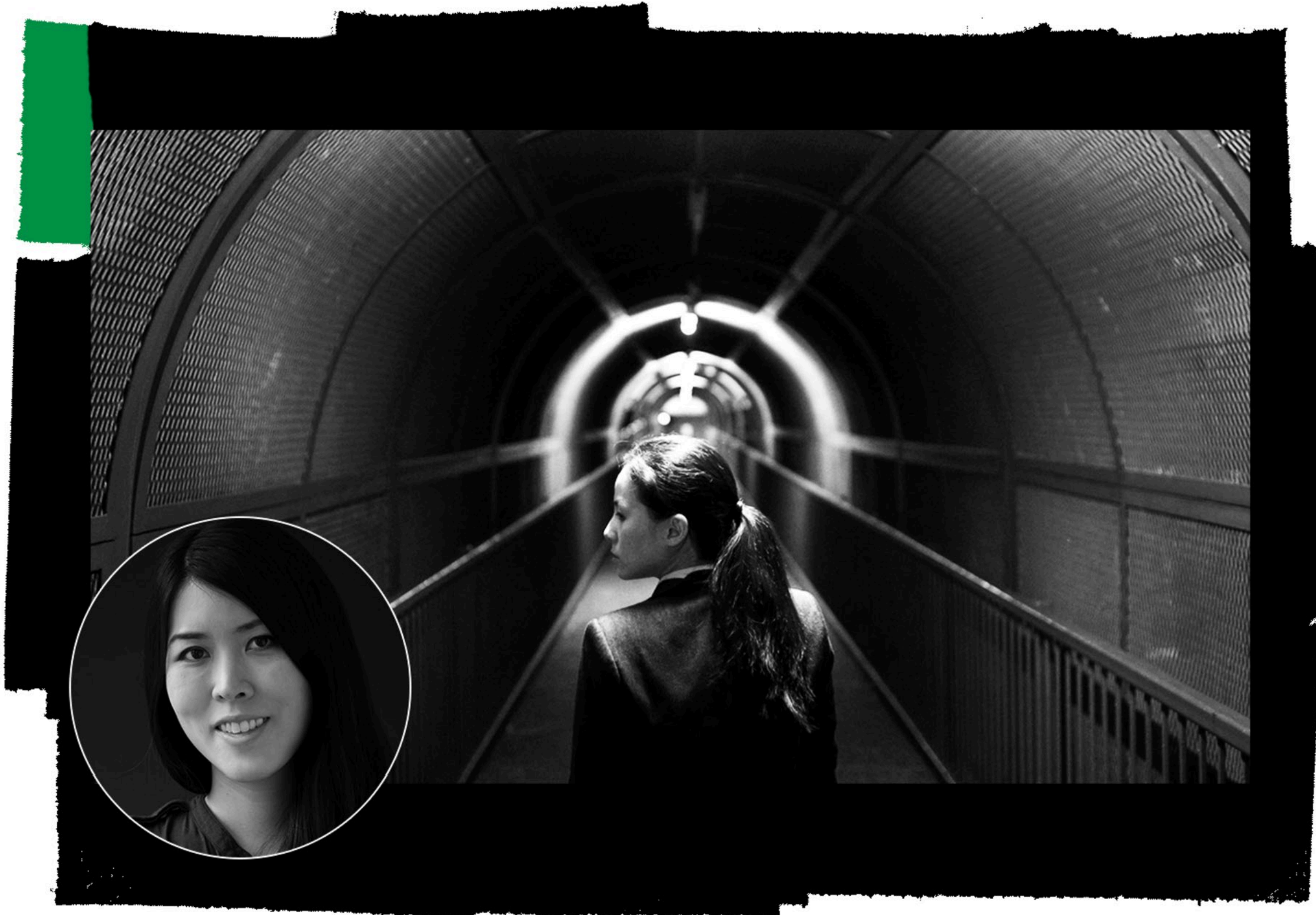
Film still credit: For We Are Strangers by Nicole Woodford