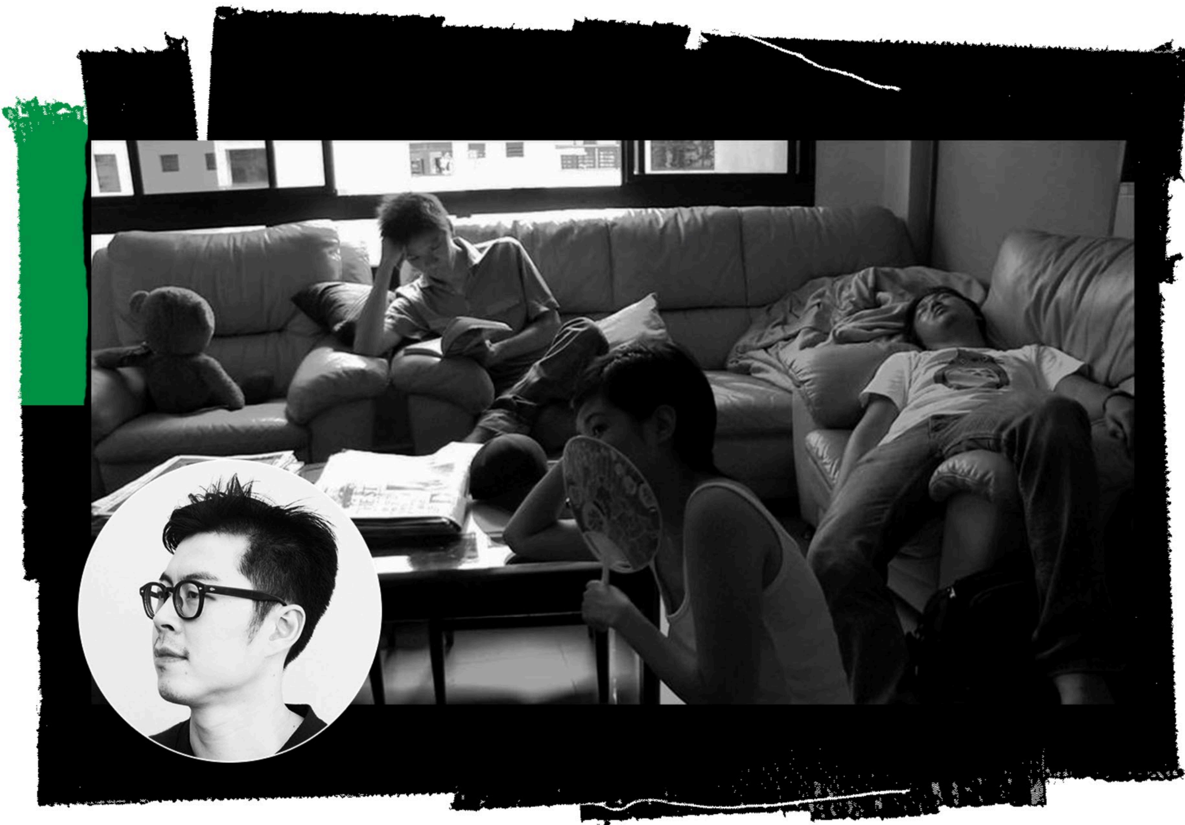
Film still credit: WHITE DAYS by Lei Yuan Bin