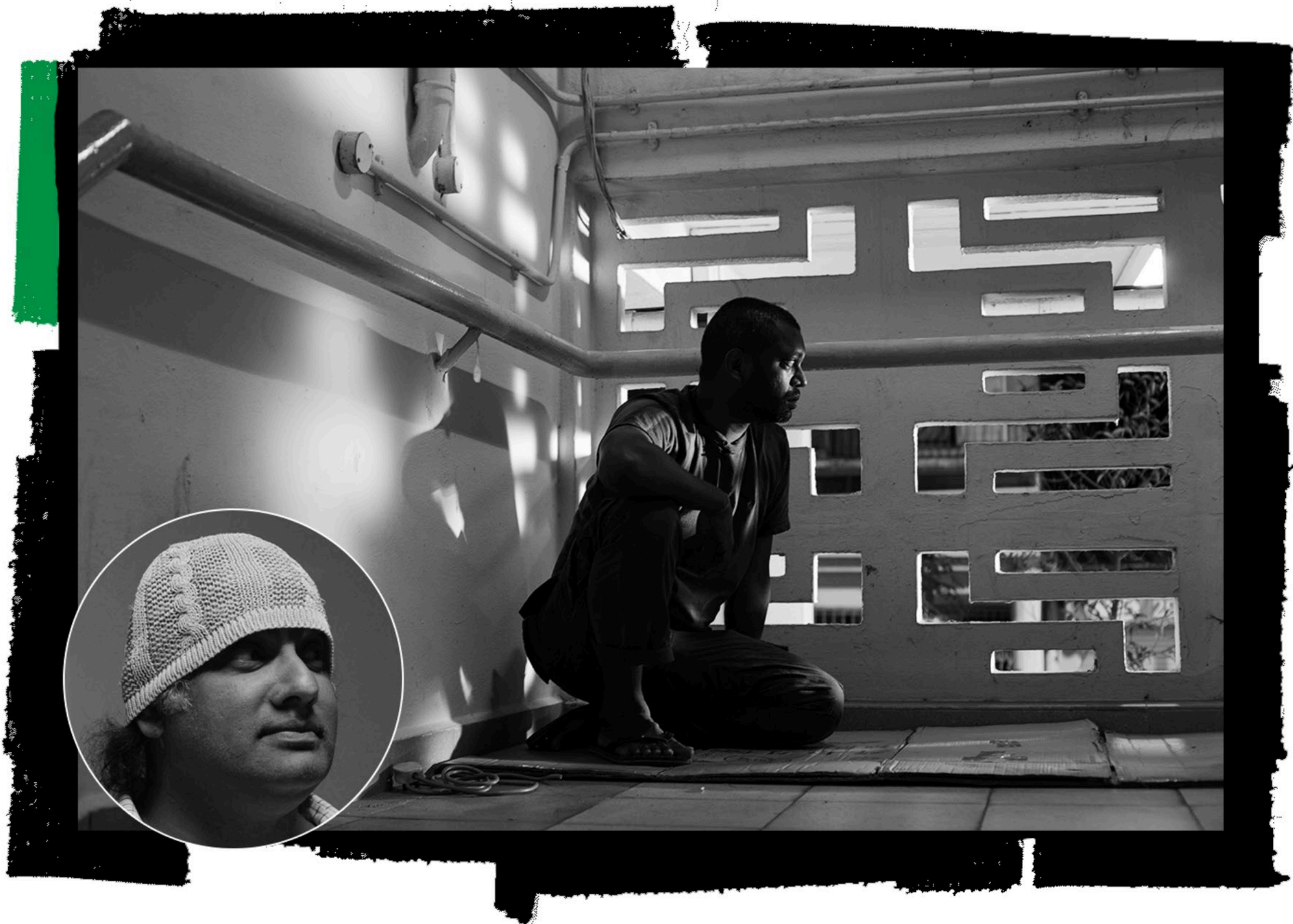
Film still credit: A Yellow Bird by K. Rajagopal (Image Courtesy of Akanga Film Asia/ Philipp Aldrup)