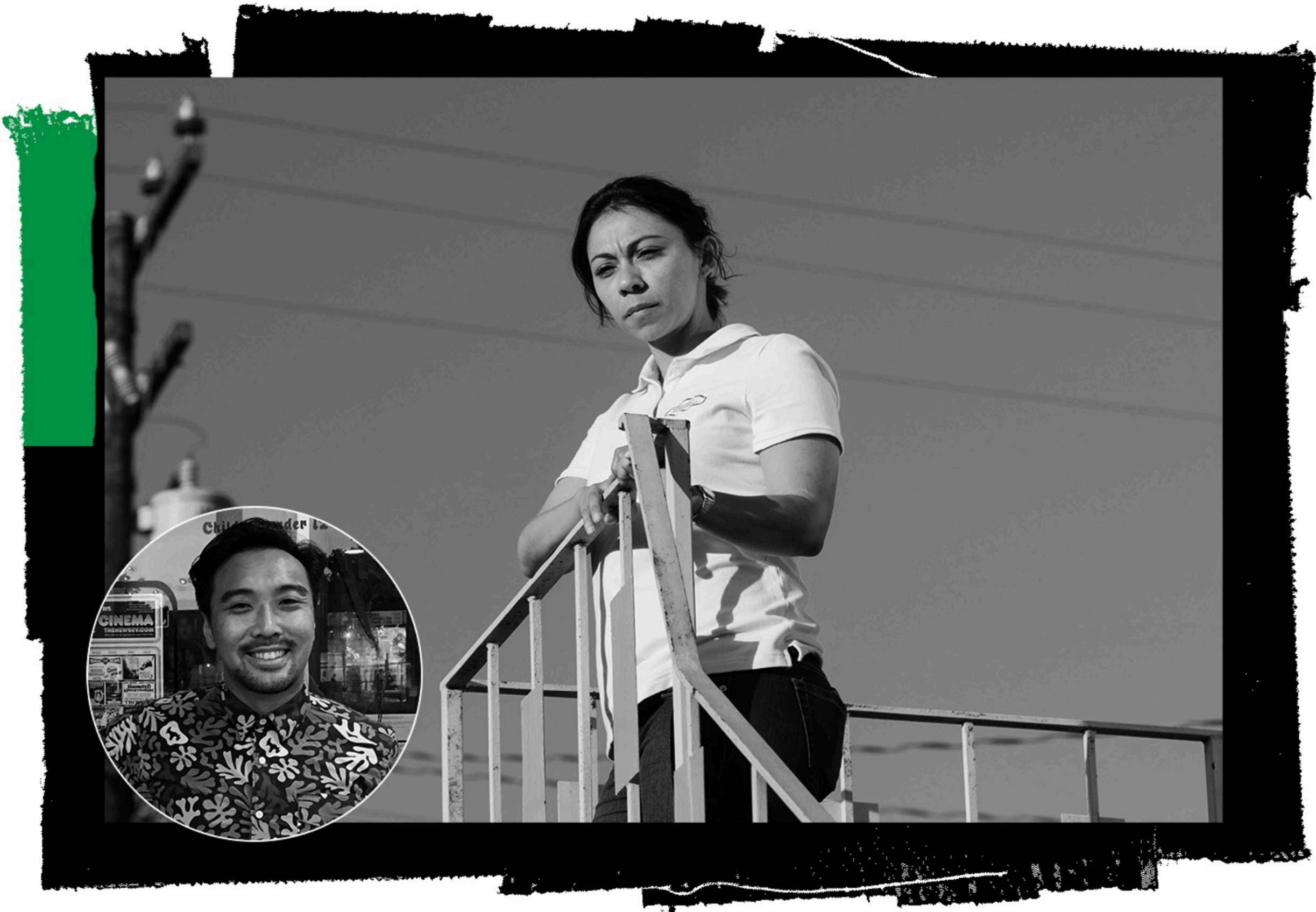
Film still credit: And The Wind Falls by He Shuming (Image Courtesy of Alex Lombardi)