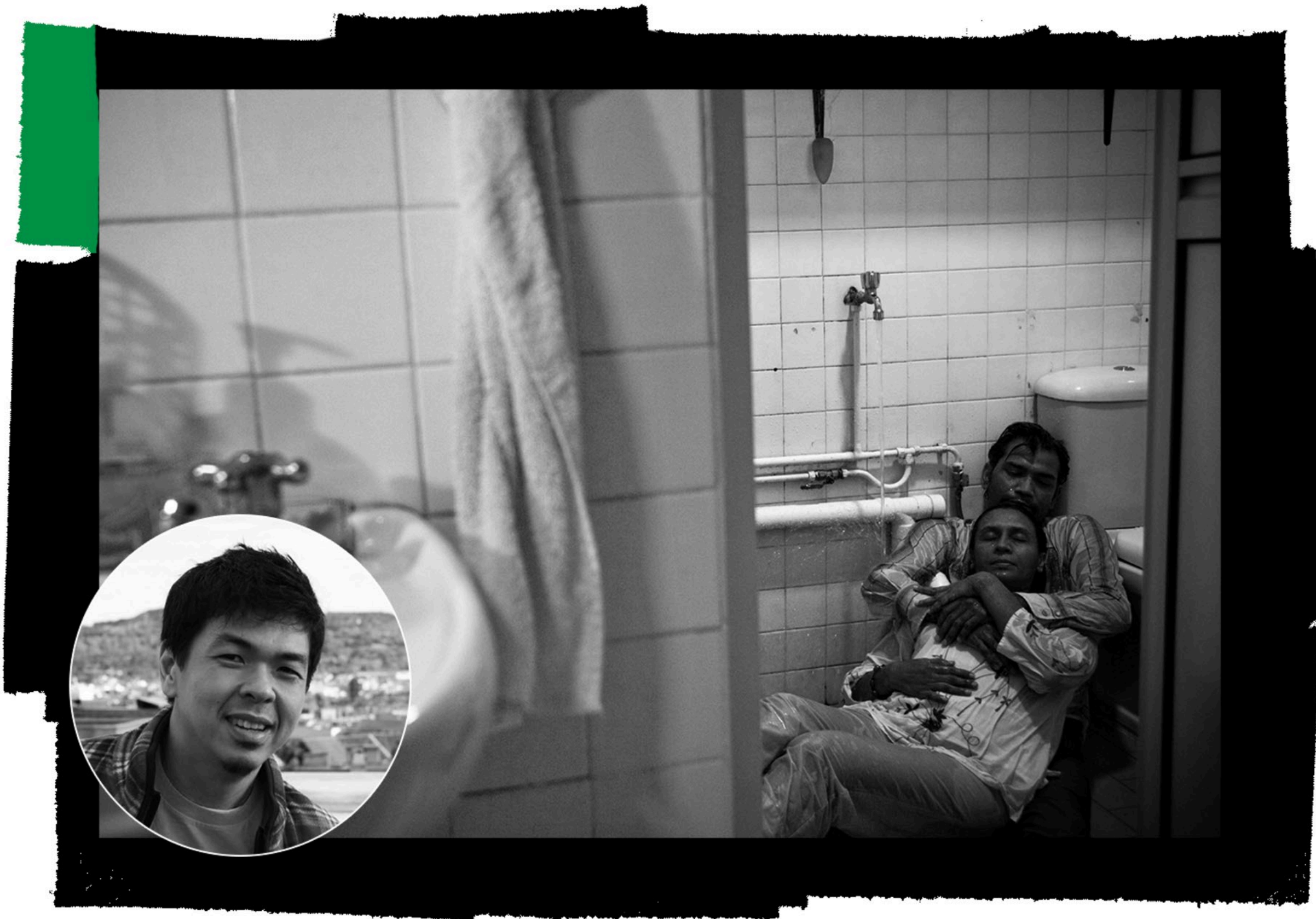
Film still credit: Flooding in the Time of Drought by Sherman Ong