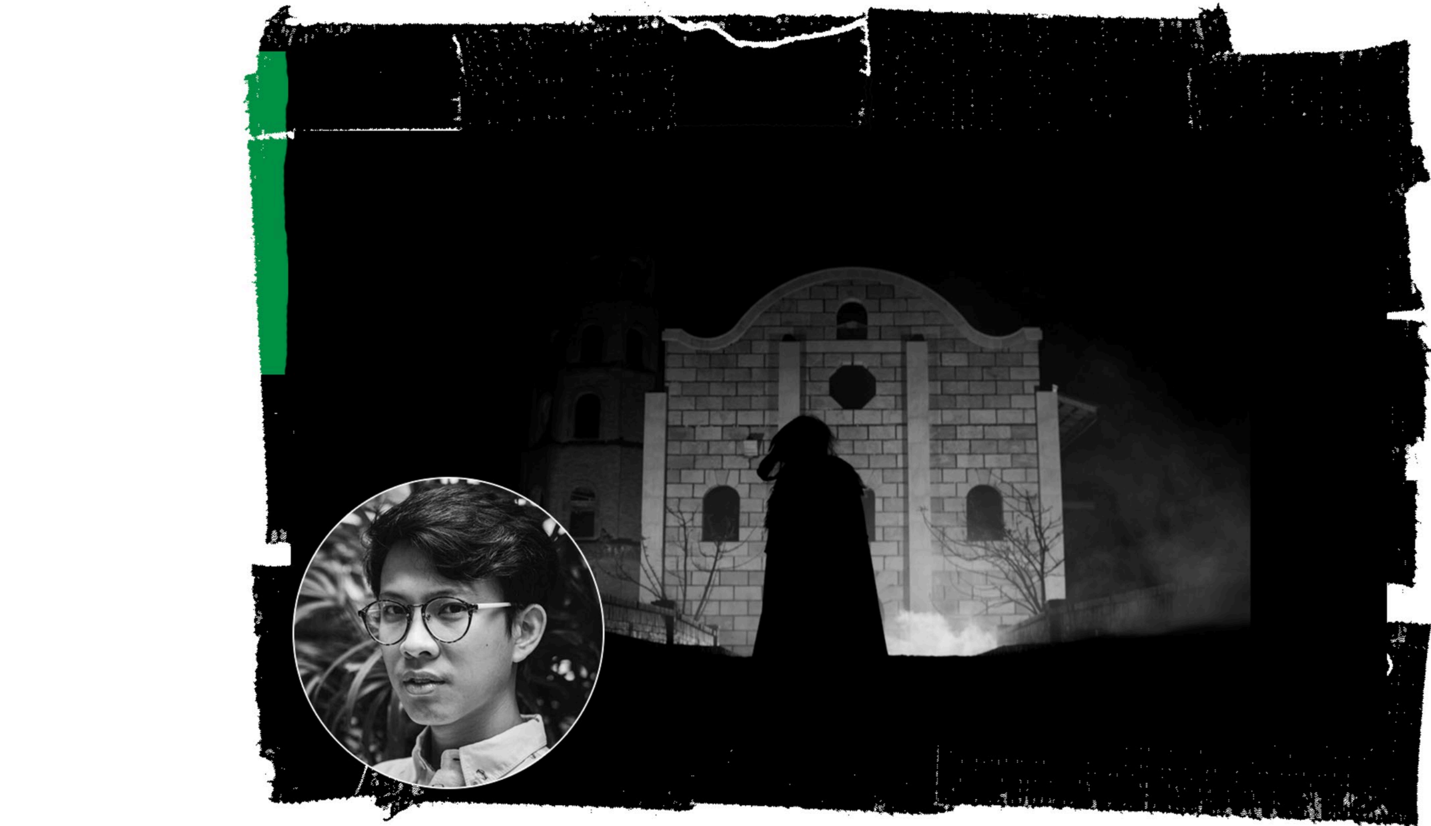
Film still credit: A Lullaby to the Sorrowful Mystery by Lav Diaz