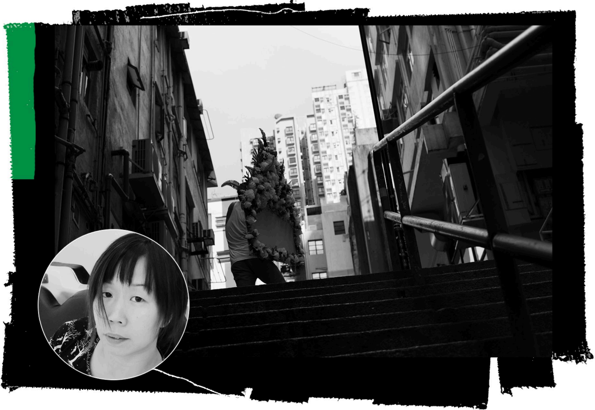
Film still credit: Forgive or Not to Forgive By Elysa Wendi